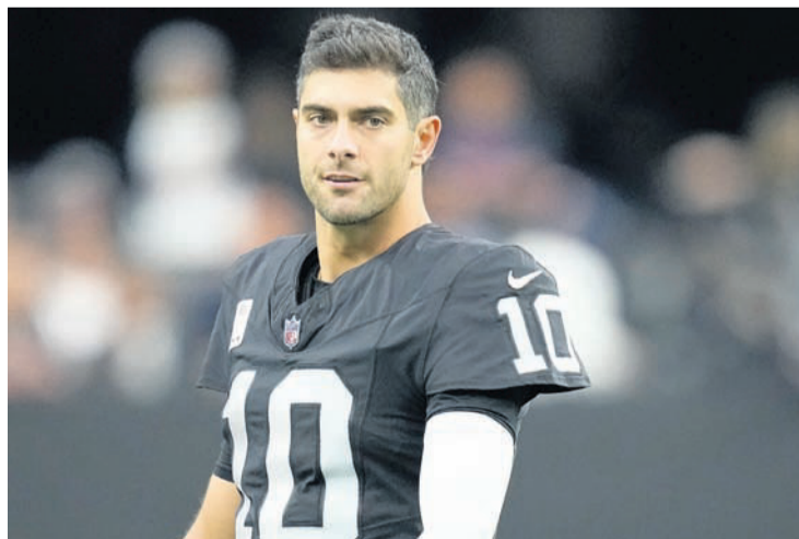
Las Vegas Raiders quarterback Jimmy Garoppolo (10) is shown before an NFL football game against the Denver Broncos, Sunday, Jan. 7, 2024, in Las Vegas.

olo last offseason to a three-year, $72.75 million contract when coach Josh McDaniels and GM Dave Ziegler were in charge. He